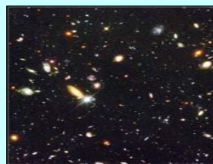
Cluster of Galaxies