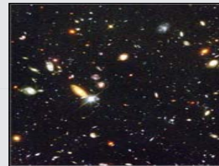
Cluster of Galaxies